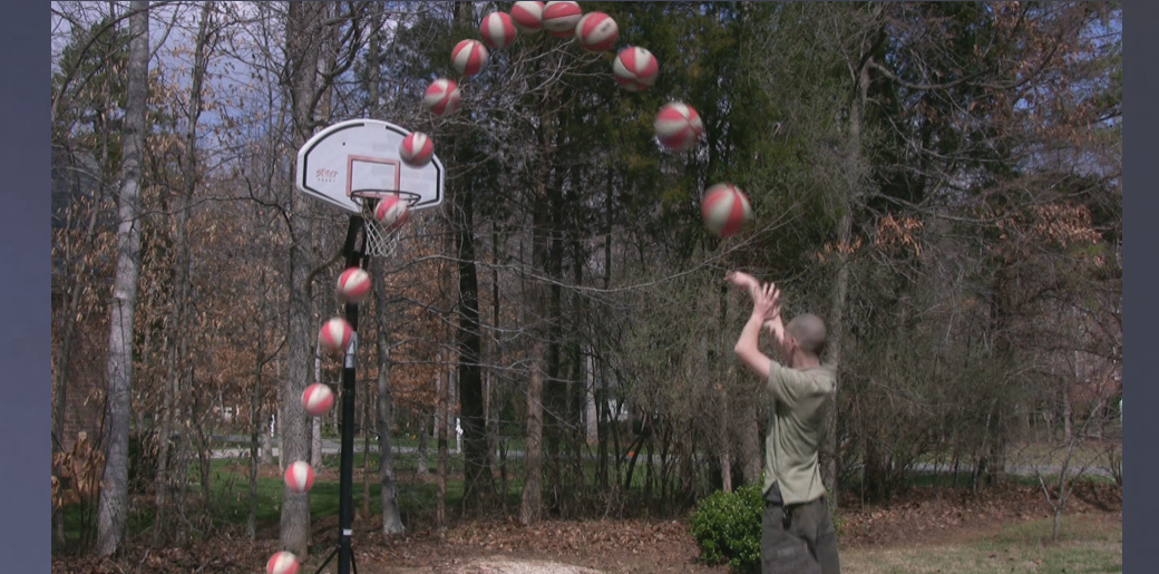
"Shoot the J! Shoot It!", Greg Gentile West Forsyth High School, Clemmons, NC Teacher: Ashley Reese

I took a photograph of a friend jumping over a gap, to illustrate the free-fall path of projectiles. It is not perfect free-fall because of air resistance, but in this case that is negligible. There is no horizontal acceleration and the only force is in the vertical direction, that of gravity. This causes the projectile to move in a parabolic path.