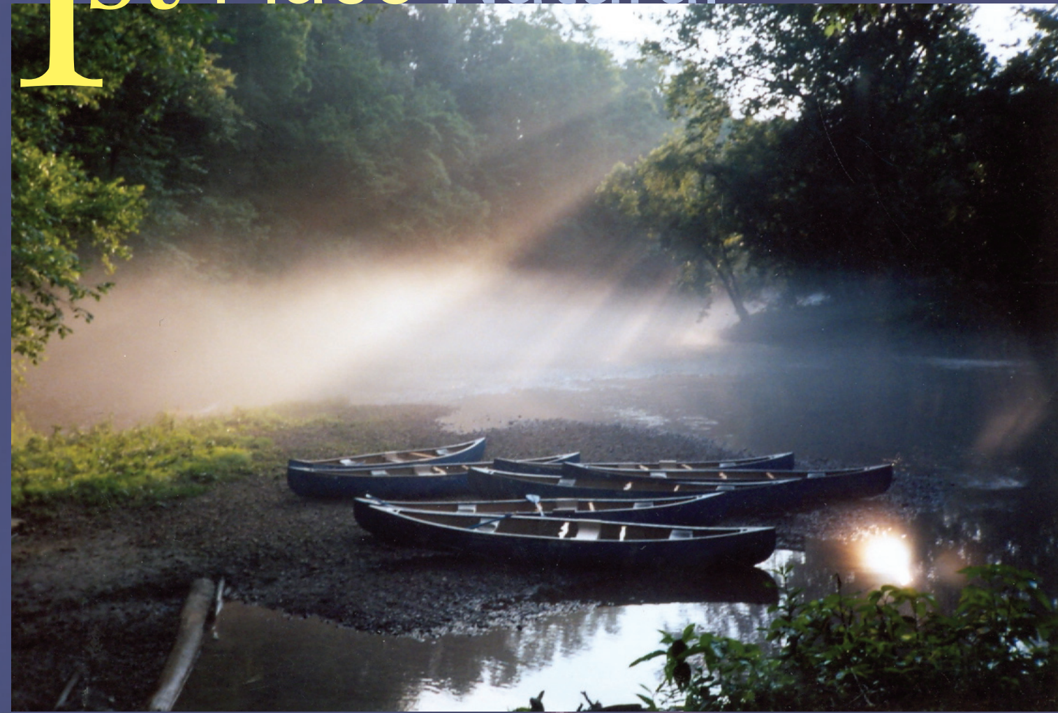
A Scattered Sun , Alexis Blanch Academy of the Sacred Heart, New Orleans, LA Teacher: Stephen Collins

Here, the sunlight is hitting a patch of fog, and the light is reflecting off the particles in the fog, allowing it to be seen. This demonstrates diffuse reflection, which happens when a wave hits an uneven surface and the reflected image is distorted. In diffuse reflection, rays that hit the surface parallel to one another are then reflected in an erratic pattern. This is what causes the reflection of the trees in the water to appear blurry.