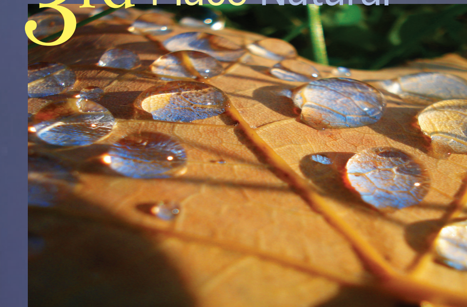
Drops of Sky , Mrinalini Modak Fayetteville-Manlius High School, Manlius, NY Teacher: Joshua Buchman

In this image, the blue reflection seen within the water droplets is actually a reflection of the blue sky above. The blue light is reflected because the water has a different index of refraction than its surroundings (the leaf and the air). The blue sky light is the result of the white light from the Sun being scattered by the molecules present in the atmosphere. Shorter wavelengths are scattered much more than longer ones, and so we perceive the sky as blue. The sphere-like shape of each droplet causes it to act as a lens, magnifying the leaf beneath it.