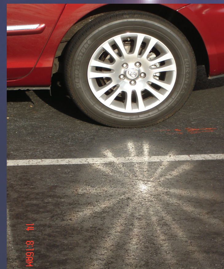
Specular vs. Diffuse Reflection , Jamie Bachman The Walker School, Marietta, GA Teacher: Sandra Rhoades

This photo depicts a reflection of car rims on asphalt, an uneven surface. Since asphalt is granular, diffuse reflection would normally occur, reflecting the light in many directions. Interestingly though, the reflection produces a mirror-like image, as from a smooth surface. Because the photo was taken when the Sun came out directly after rain, the asphalt was still wet. Water filled the uneven crevices of the pavement, creating a smooth surface. Therefore, when the Sun hit the rims and reflected off of the wet pavement, specular reflection occurred, producing the spiral image of the rim.