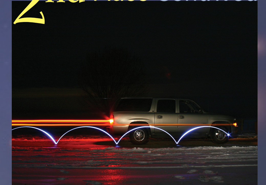
Nighttime Cycloid , Charles Grimmert Amherst Steele High School, Amherst, OH Teacher: Charles Deremer

Named by Galileo in 1599, a cycloid is the path that a point on the edge of a circular wheel follows as the wheel rolls along a straight line. This photo is a long exposure taken at night. I attached an LED to the edge of the tire, opened the camera's shutter, then had my dad drive the vehicle in a straight line until it reached where I knew the edge of the frame was. In order for the vehicle to show up, I had to illuminate it for about 10 seconds with a spotlight.